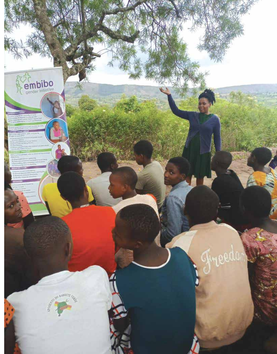
Peer educator session in Mutama