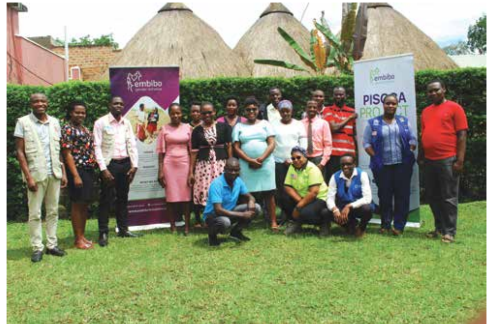
Strengthening partnership and ally ship with CSOs, district and health technical Partners for gender equality and social health service delivery