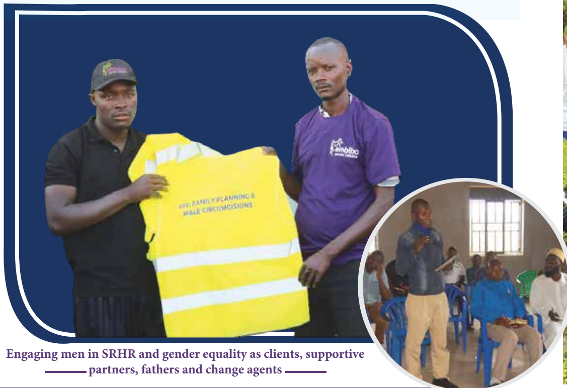
Engaging men in SRHR and gender equality as clients, supportive partners, fathers and change agents

1. 20 religious, traditional and other local male leaders engaged in a 3-day male information session to address the role of men through a gender transformative approach of men as change agents, clients, supportive partners and fathers in relation to SRHR.