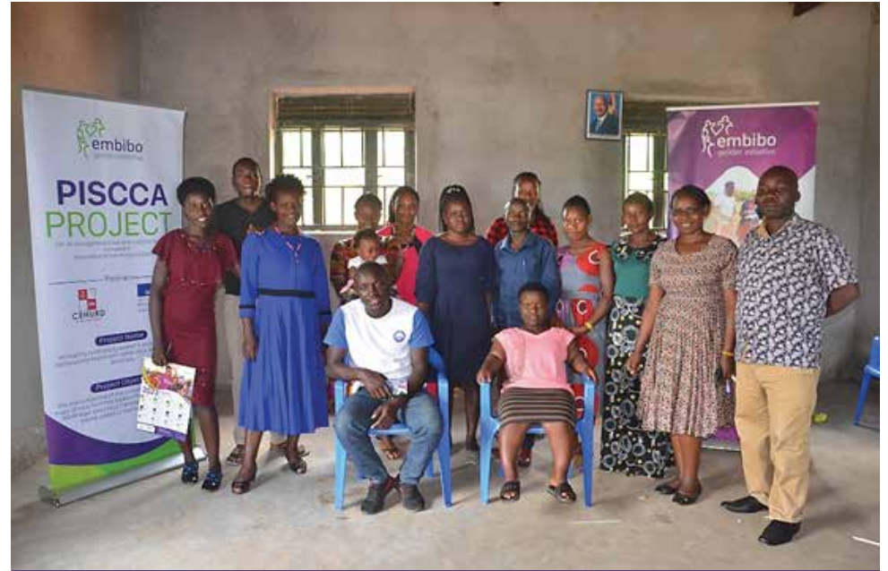
Youth leader kick start meeting for project consultation