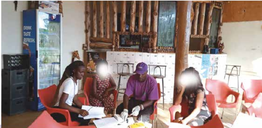
EGI staff and peer educator carry out HIV testing at a hot spot