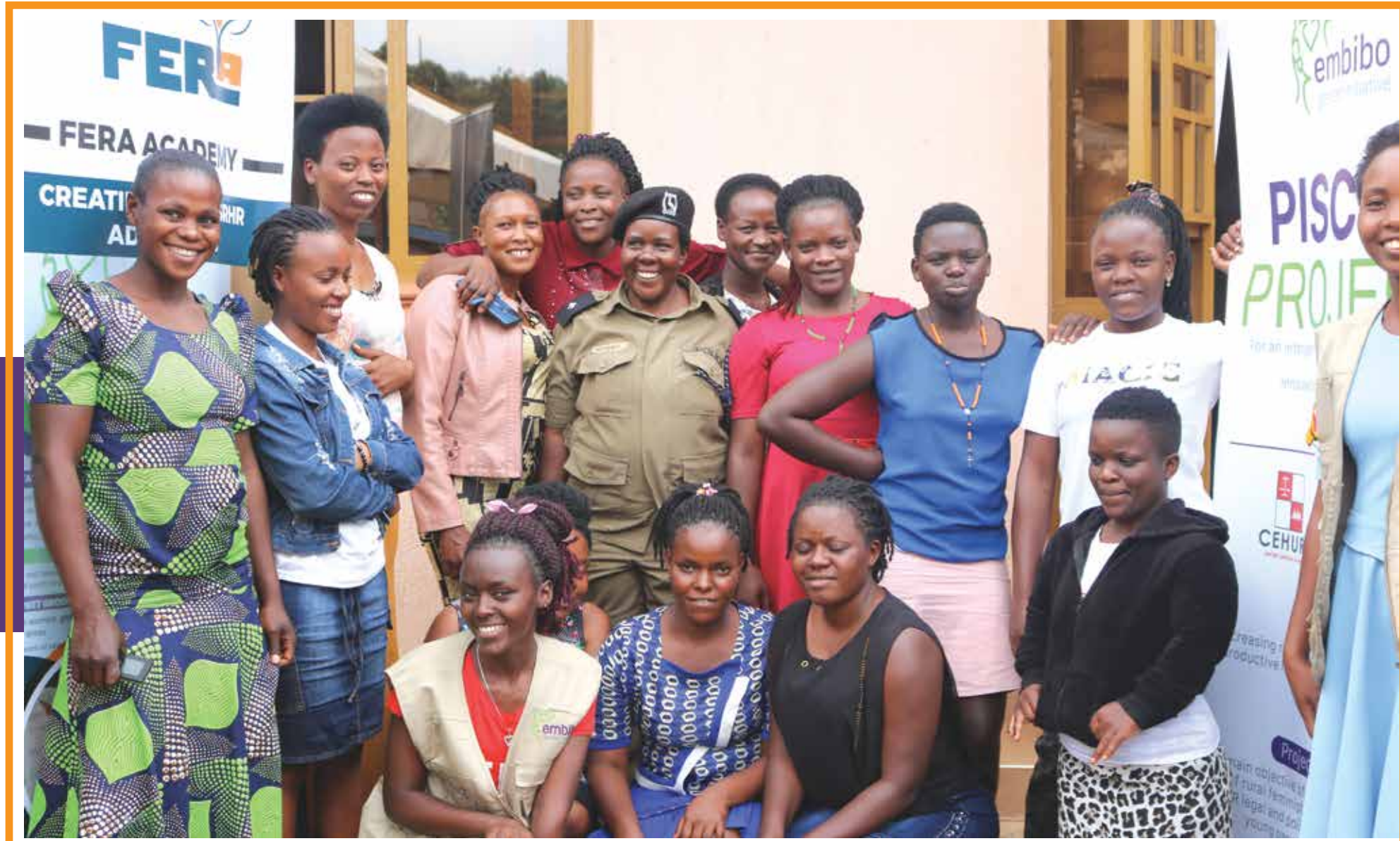
The Feminist Rural Academy (FERA) Empowering Rural Young Women with skills and knowledge to collectively advocate for their rights and lead change.