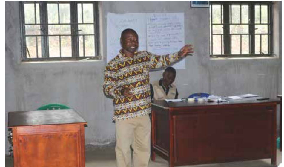
Assessing men and masculinities and how these affect access to SRHR in Kamwenge.