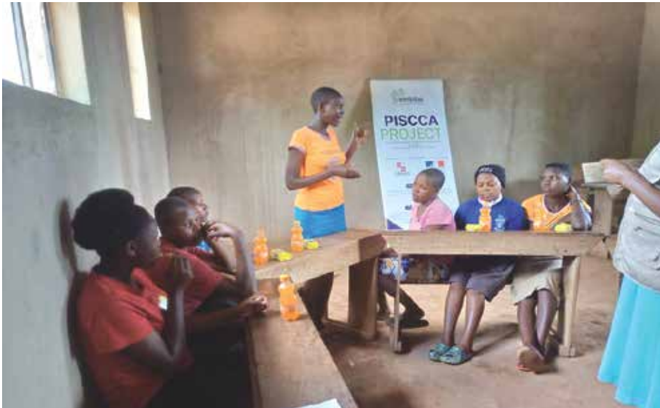
Creating safe environment through Age appropriate Sexuality education for teenage pregnancy, sexual violence and HIV/AIDs prevention