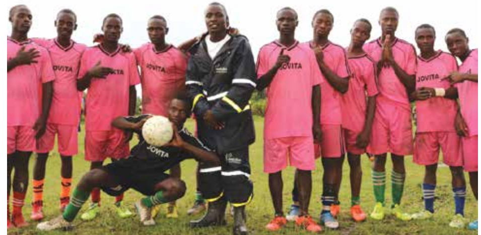
The winners of the Embibo Football cup, Bwizi Senior Secondary School pose for a photo after the match