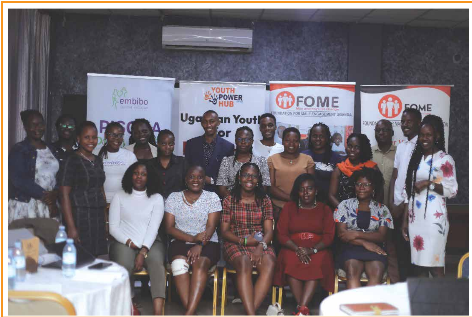
Figure 12: CSO advocacy Meeting in Kampala