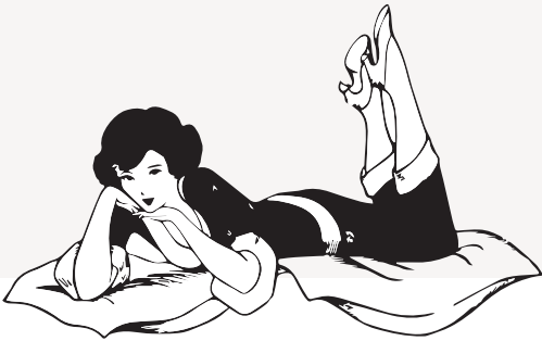
Illustration EGI -01

“We were told that traditionally if one lies facing down after sex, then they will not get pregnant because the sperm will flow out.” FGD participant.