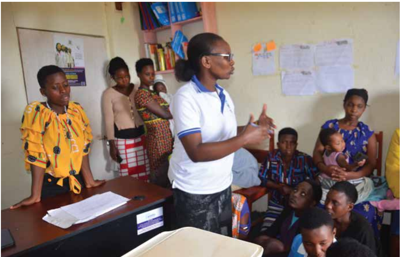
Photo during condom programming session

In order to improve the country’s response and achievement of the UN AIDS 95-95-95 targets by 2025 as well as other gender SRHR parity advancements in the Uganda third national development plan, Africa Agenda 2060, MAPUTO protocol among others, AGYW (15 to 25 years) most affected by HIV, consequences of teenage pregnancies and sexual offences have to become active technical partners.