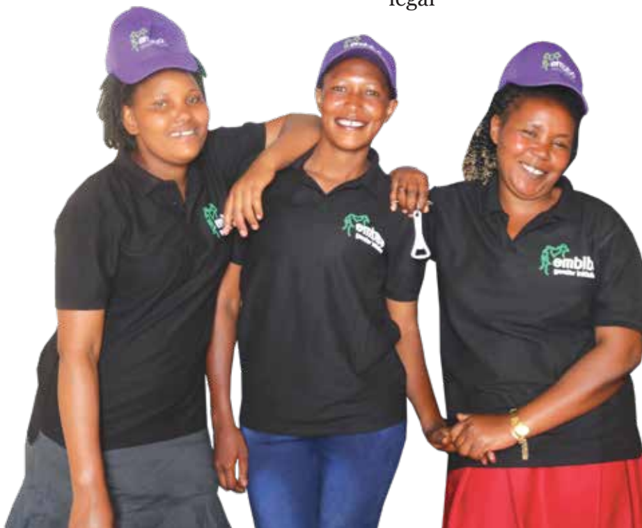
Group photo with the peers after a training

This study is the first qualitative study to review the state of SRHR for AGYW in rural Kamwenge especially surveying AGYW, young men and duty bearers working in health and political leadership. It interviewed young people between the ages of 14 to 25 years old on their experiences accessing services, information and legal